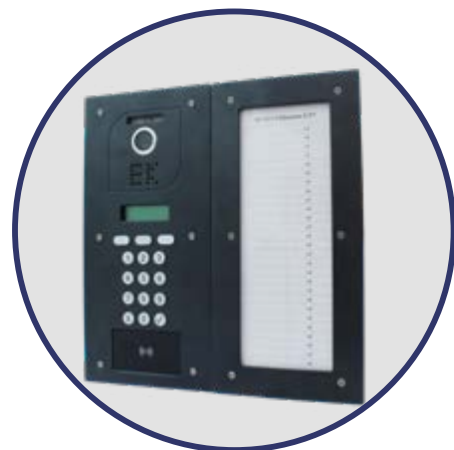
Integration with PD directory