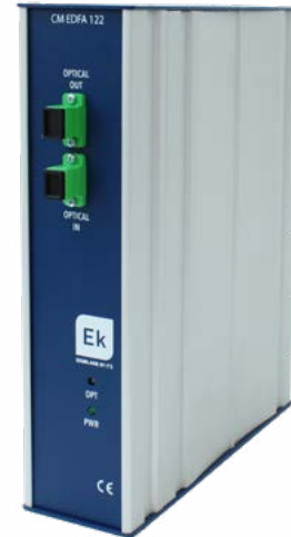
CM EDFA 122