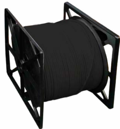
CLU 6 CU PE