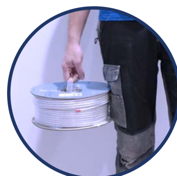
EK ROLLER REEL HANDLE