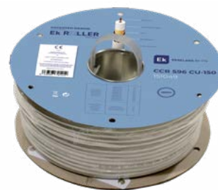
CCR 596 CU-150 coil with Ek ROLLER system