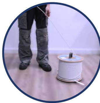
EK ROLLER COIL UNWINDING