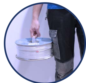
EK ROLLER REEL HANDLE