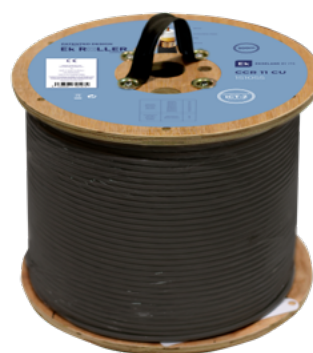
CCR 11 CU coil with Ek ROLLER system