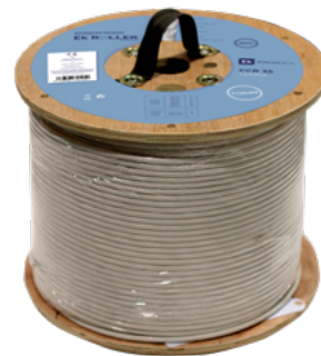
CCR 112P-D-250 coil with Ek ROLLER system