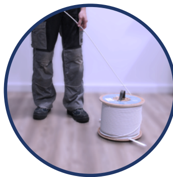
EK ROLLER COIL UNWINDING