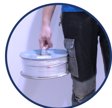
EK ROLLER REEL HANDLE