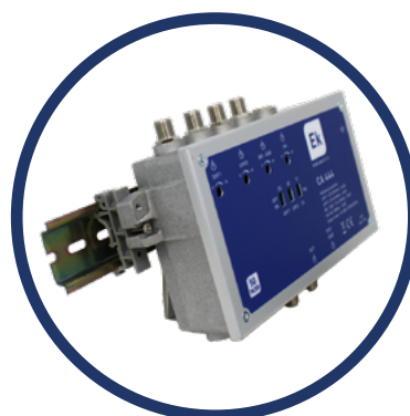
Broadband amplifier mounted on AMCD