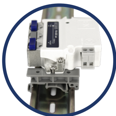
QuiCoax power supply mounted on AMCD