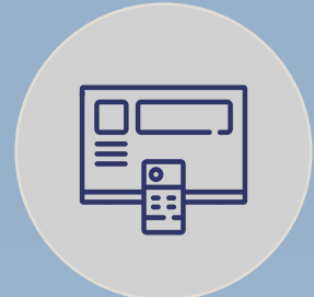
TV, TDT, SAT AND IPTV CHANNEL PROCESSING AND DISTRIBUTION