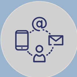
CREATION OF INFORMATION CHANNELS