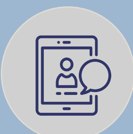
HOTSPOT. WELCOME PORTALS