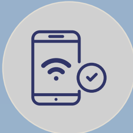
FAST AND SECURE MOBILE CONNECTIVITY (BYOD-BRING YOUR OWN DEVICE)