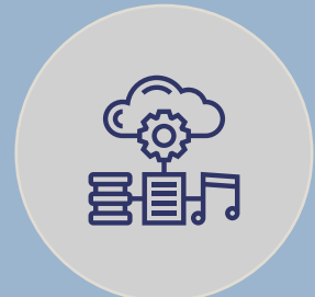
ACCESS TO MULTIMEDIA SERVICES WITH MOBILE DEVICES AND SMART TV