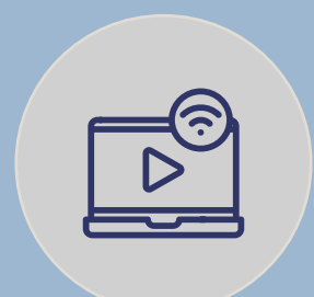
OTT - STREAMING SERVICES OVER WIFI