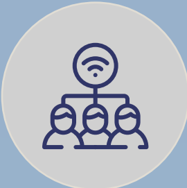
SCALABLE WIFI COVERAGE