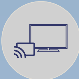
CASTING. FIRST-CLASS ENTERTAINMENT AND IN-ROOM INTERACTION