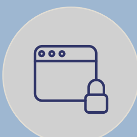
SECURE INTERNET ACCESS WITH INFORMATION CLASSIFICATION AND NETWORK AUDIT