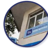
MADRID HEAD OFFICE Madrid