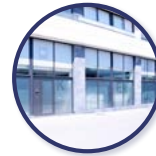
HEAD OFFICE Sant Cugat del Vallès, Barcelona

Recently, the Spanish company OPENETICS , has also joined the group, specializing in the manufacturing of structured cabling solutions, fiber optics, rack cabinets, and PDUs, meeting the most demanding international quality standards. To learn more about OPENETICS product range, you can check their catalog at www.openetics.com .