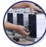
ASSEMBLING AND PRODUCTION LINES -Barcelona - Las Palmas G.C.