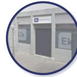
CANARIAS SUBSIDIARY Las Palmas G.C.