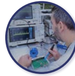
R&D CENTERS -Madrid -Zaragoza -San Sebastián -Las Palmas G.C.