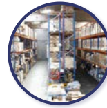
LOGISTIC CENTER Sabadell, Barcelona